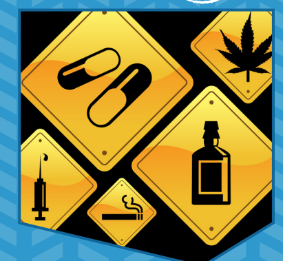
Alcohol & Drug PREVENTION